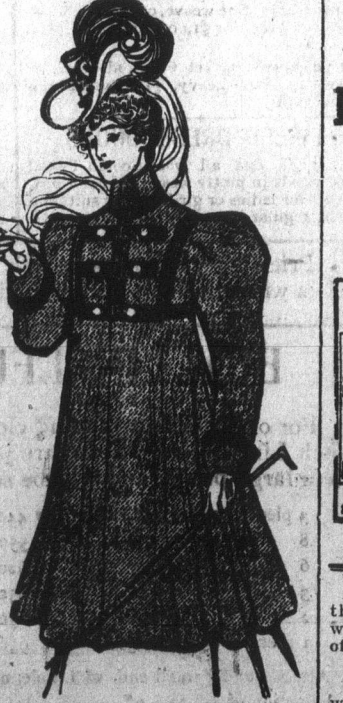
GRAY-BLUE TWEED COAT.

The Empire's Favorite Model—Chif- fon Velvet—For Blouses. First and foremost among coats is the empire in its vast range of styles and shapes, the distinguishing feature of short bodice effect being maintained throughout. In light pastel toned cloths this coat serves the double pur- pose of day and evening use. Chiffon velvet is a lovely fabric that is used in the fashioning of smart and becoming blouses. Umbrella skirts are favorite models, although the many gored skirt is be-