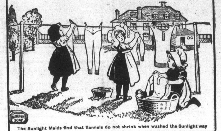
The Sunlight Maids find that flannels do not shrink when washed the Sunlight way

The pride of the housewife is the bread she bakes. Its lightness, crispy crust, even goodness depends to a certain extent on her skill but to a greater extent on the oven. To get bread perfection you need the evenly distributed heat of the oven of the