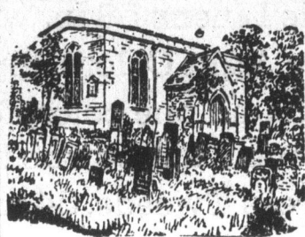
CHURCH OF ST. MARY IN ARDEN.

Near to Market Harborough, Eng- land, stands the ancient Church of St. Mary in Arden, which acquired so bad a name from the celebra- tion of furtive marriages that its per- petual curacy was consolidated with that of Market Harborough in 1614 by the Archbishop of Canterbury and the Bishop of Lincoln. But in order that St. Mary's might not be utterly neglected the document decreed that service should be performed there occasionally, whilst marriages should be solemnized at Market Har- borough. The church has a large burial ground which is used by many families. Its tower and spire, as if ashamed to longer uphold its head, crashed through the body of the church during 1622, after which the church remained in ruins for about thirty years. It was rebuilt in 1693,