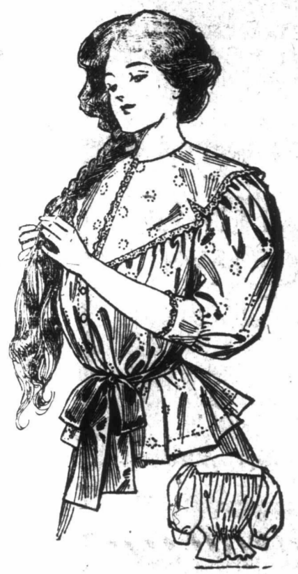
1898 LADIES' YOKE DRESSING-SACK

For an all-over apron this little plaited affair made of red and white cross-barred gingham presents many advantages.