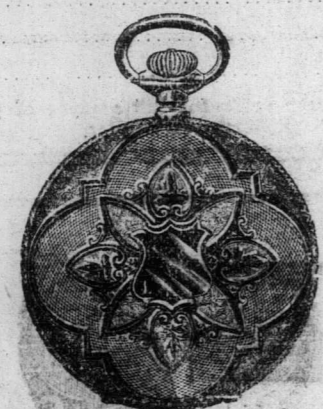
On Exhibition at BULLER BROS. and NEW- MAN AND SONS' Jewellery Stores.