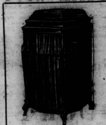
On Exhibition at CHAS. BROWN'S and T. J. BARTON AND SON'S Music Stores.

Call all your friends together, use the telephone this very minute and tell them about the last vote offer that you will be able to get extra votes on subscriptions, and where you stand a good chance of winning the Grand Prize if you can have their support this week. Get them together, and make one good strong appeal to every one you meet. Make this week pay you the biggest dividends of your life. There is not a single candidate who cannot win the Grand Prize if they make the best of their time this week. Candidates should secure everyone's subscription in Brantford and surrounding country this week with this subscription offer. Three and one half times as many votes on subscriptions this week as there will be next week, when the contest closes.