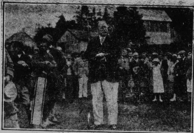
EX-PRESIDENT OPENS COURSE.

For references—Head Office, Toronto, Montreal, or your local banker, published by over thirty banks.