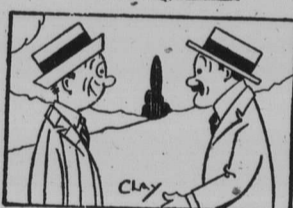
Not Going Just Now.

"That vaccine isn't made for nothing, but—the moment the government spends on it (it's all free, you know) means a real service to the people." Protection, safe and sure, may be had against diphtheria, scarlet fever, typhoid fever and smallpox. Tested products distributed free within the province by Ontario Department of Health, Spadina House, Toronto.