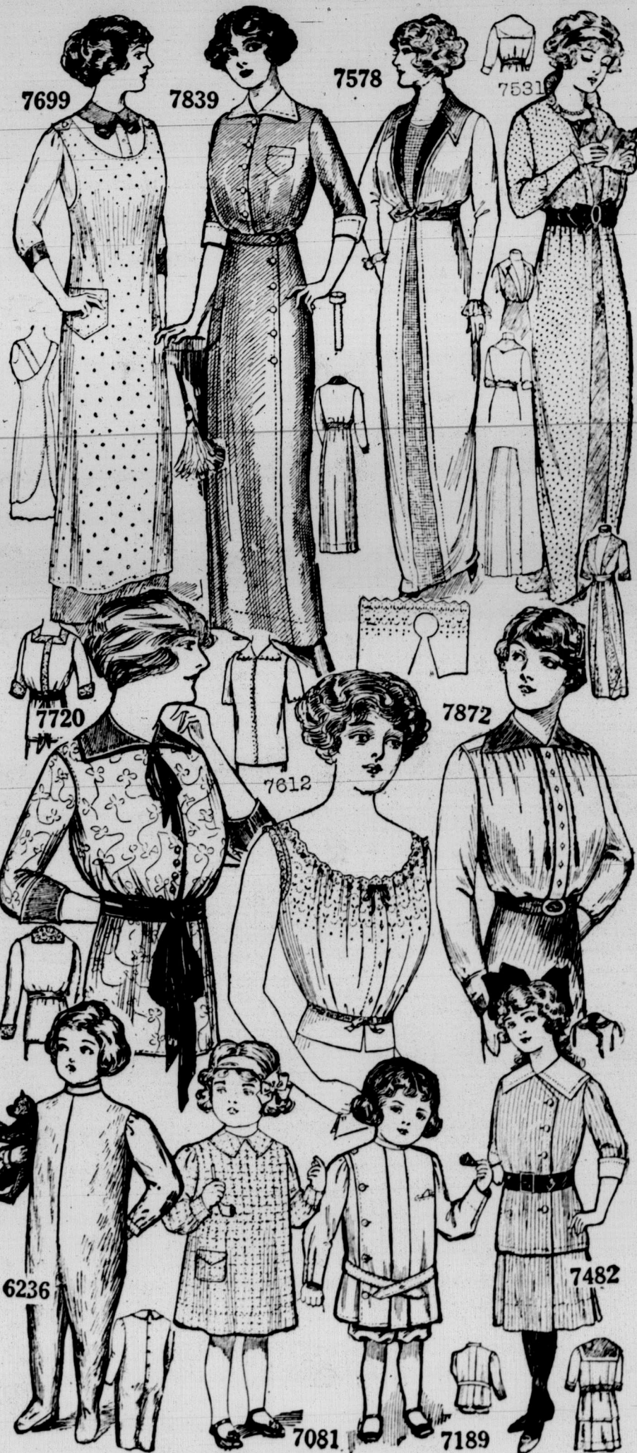
PRETTY AND PRACTICAL PATTERNS

NOTE—Ten days to two weeks must be allowed for the forwarding of patterns.