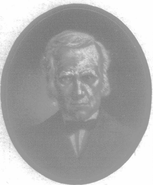
The Discoverer of the World's Greatest Remedy for Piles.

Pyramid Pile Cure is put up in the form of suppositories which are applied directly to the affected part. Their action is immediate and certain. They are sold at 50 cents the box by druggists everywhere, and one box will frequently effect a permanent cure.