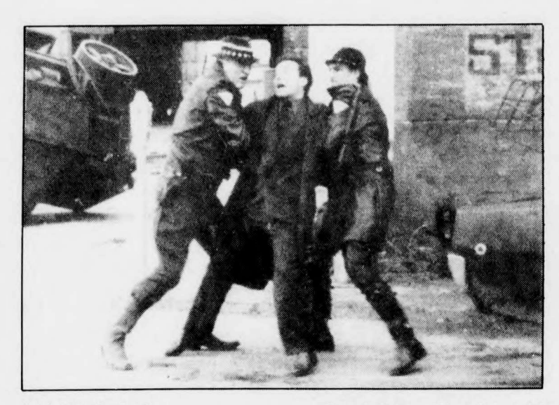
by Letitia Tendentious

Terminal City Ricochet directed by Zale Dalen E. Motion Films