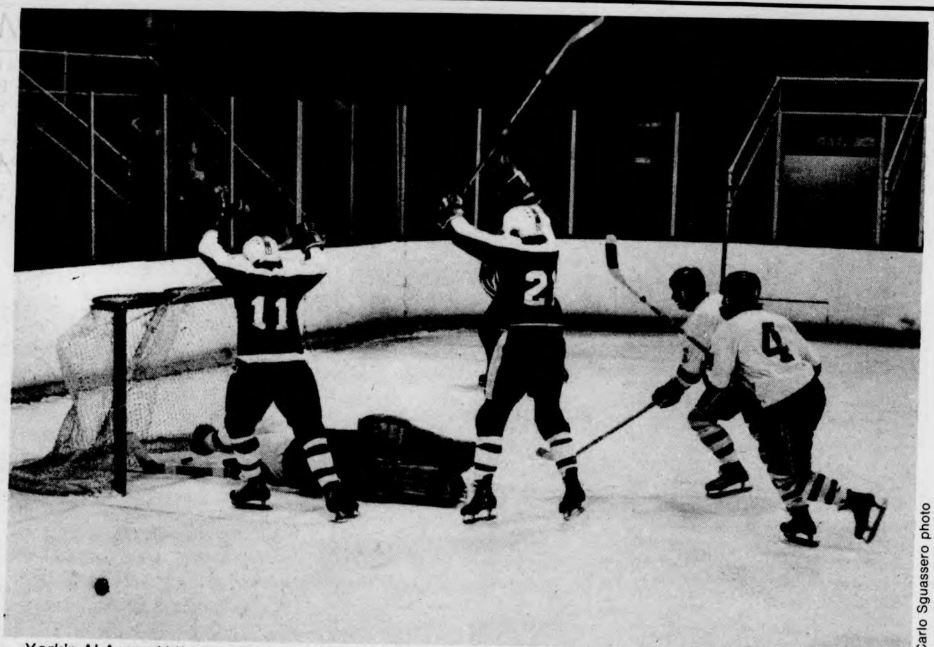
York's Al Avery (11) and Tim Ampleford (21) raise their sticks in jubilation following Ampleford's power play goal in the second period in the Friday night