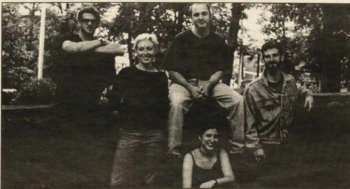
Unmasked: new troupe Exodus Theatre want the world to know about them.

Fanciful and sharp, Exodus' Julius Caesar is a must see for classics-buffs and Shakespeare-dummies alike. The play runs October 7-9 and 14-16, 8 p.m., at St. Mathew's Church, 1479 Barrington Street.