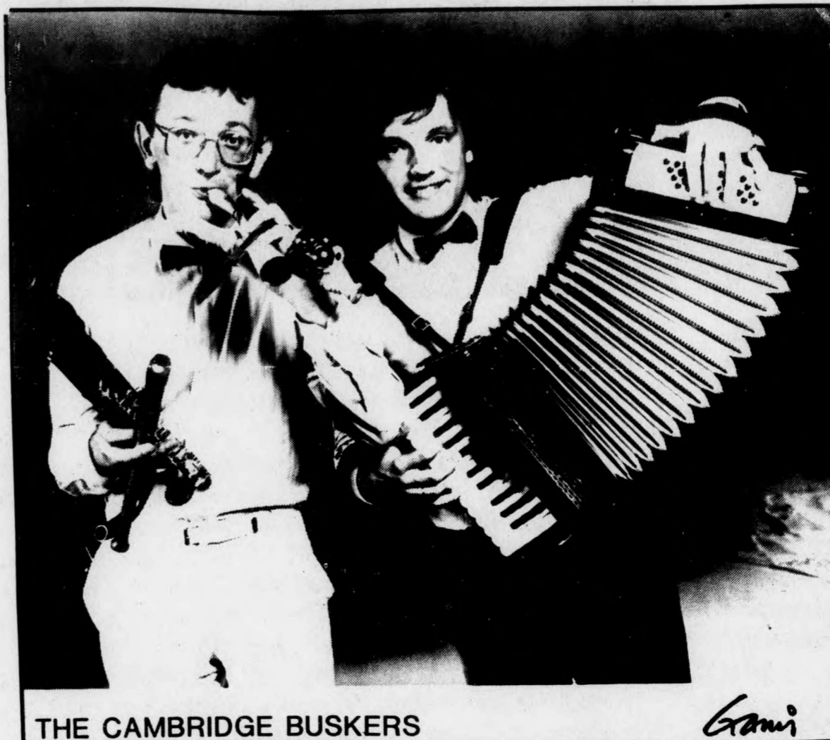
THE CAMBRIDGE BUSKERS

All in all, it was a truly exciting evening, and to those of us who do not listen to classical music that often, it was also quite educational. Hats off to the Buskers!