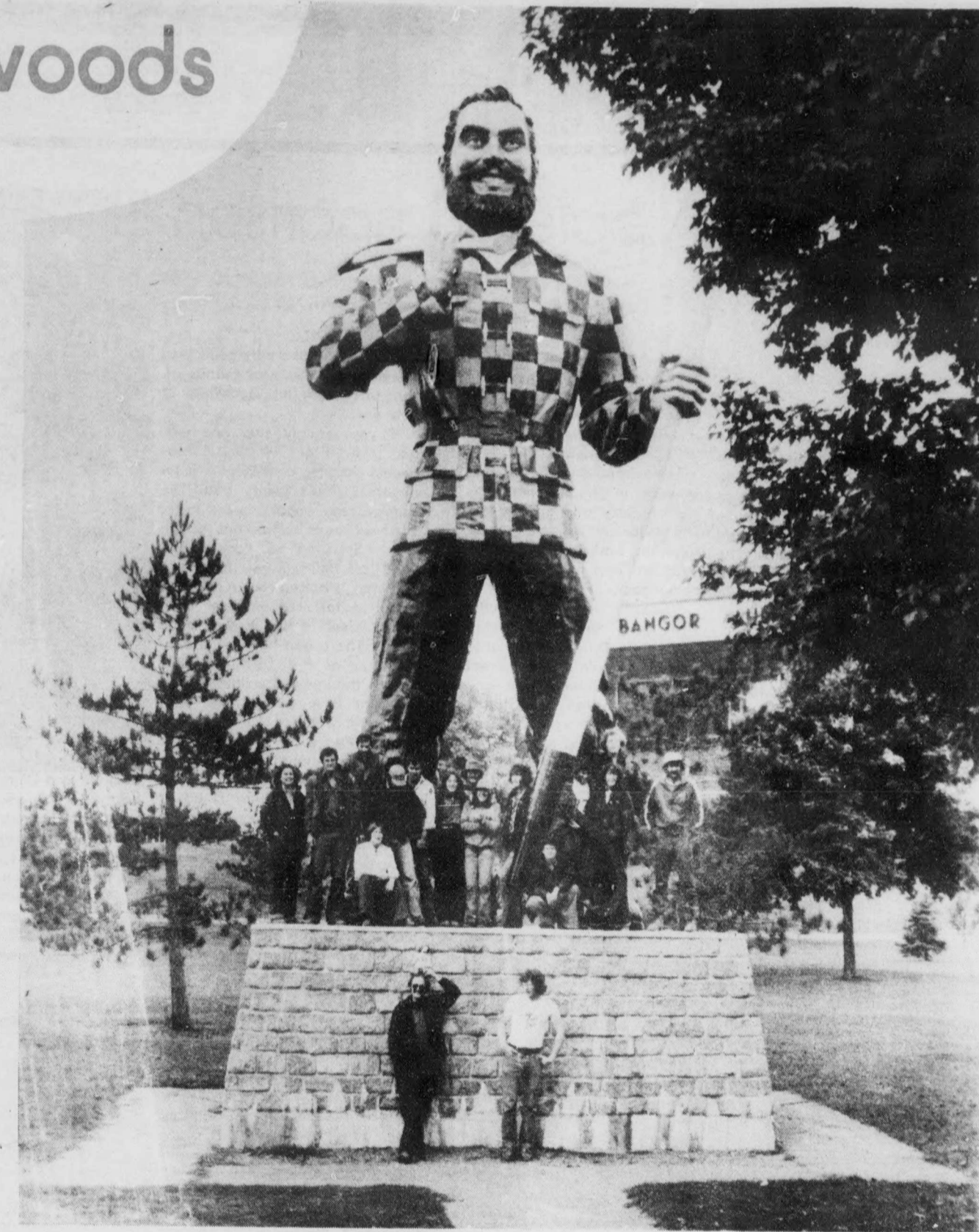
The UNB Woods-men and women's teams stand with Paul Bunyan during a recent competition in Maine.