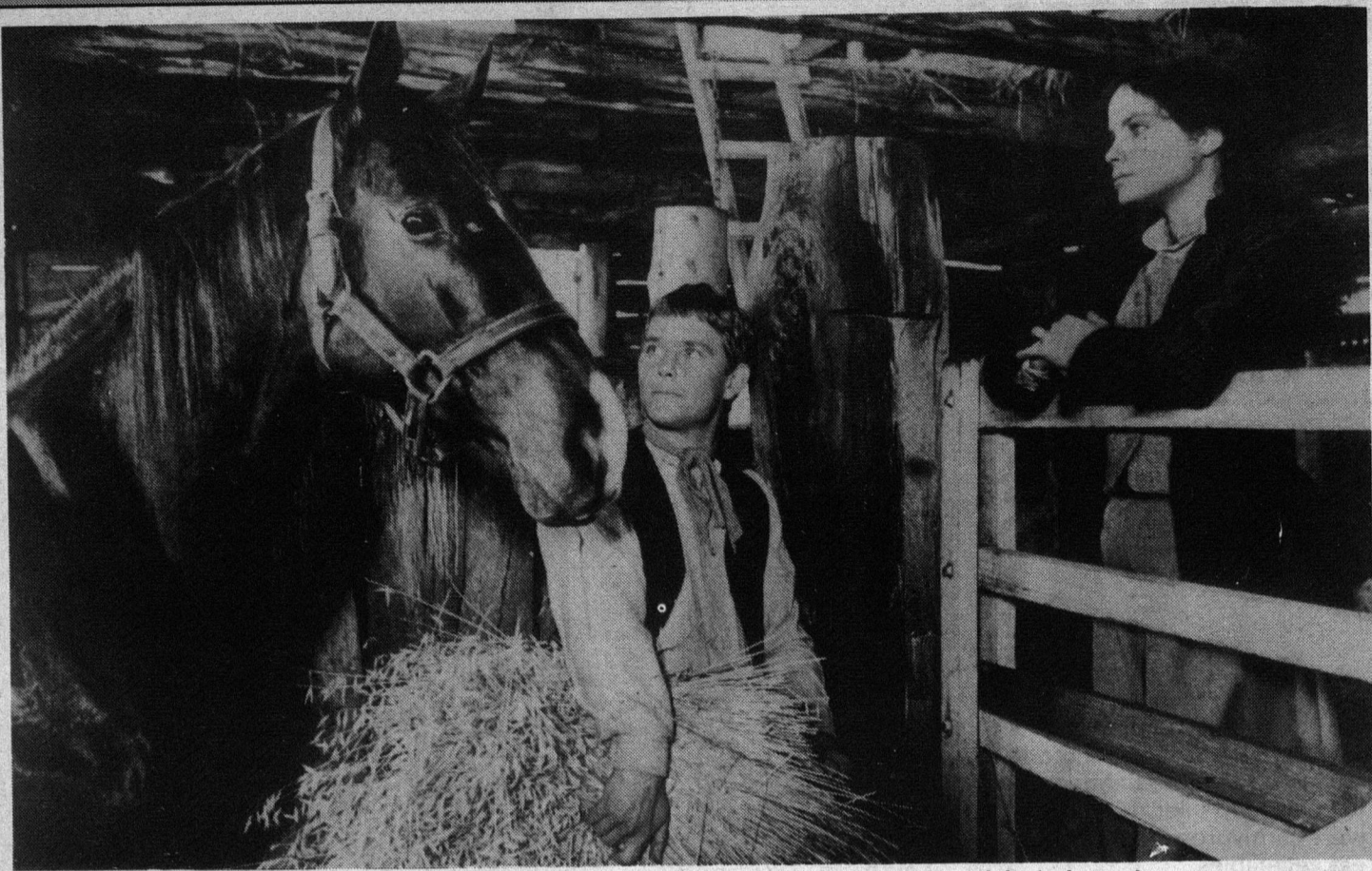
Mr. Ed, the talking horse, stars in the Citadel's production of King Lear. Cordelia and the fool consult.

All in all this is very probably a fine show, and not to be missed.