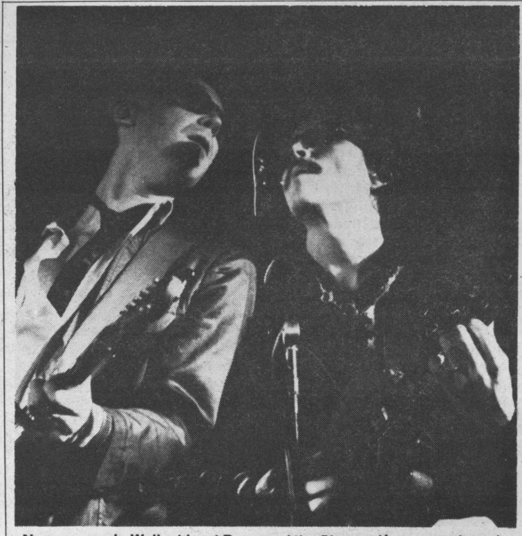
No more punk. Well, at least Doug and the Slugs, a Vancouver-based punk band, got their licks in Friday in SUB Theatre before the ban