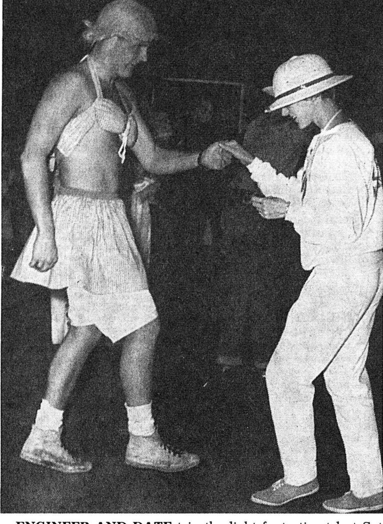
ENGINEER AND DATE trip the light fantastic at last Saturday's dance. One wonders who is the engineer and who is the

After a discussion period the audience voted 104 in favor of the affirmative, 24 for the negative