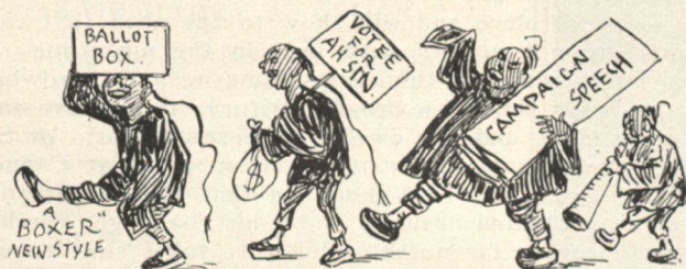
China now has Responsible Government.

China has made another step towards the introduction of Western civilisation. Her army has been reorganised on occidental lines and now a form of constitutional government has been introduced. Is this due to the influence of Japan or Europe? Perhaps both. In either case it shows that the awakening of the Chinese Giant is proceeding apace. Autocratic vice-roys governing large provinces without consultation with the people has passed out and the Chinaman is to lose his political passiveness.