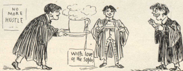
Tea instead of Tribulation for the Freshie.

There are 164 distillers of whiskey in Scotland and the stock on hand is equal to four years' consumption. Hence, there is talk of restricting the output so as to reduce stocks and raise prices. Higher prices are necessary because of the increased cost of coal and barley. It might be advisable for those who have a fondness for this beverage to stock their wine cellars at present prices. The visit of the Boston Ancient and Honourable Artillery Company is said to have materially reduced the stock in Toronto.