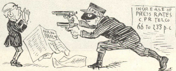
A Bold Hold-up in the West.