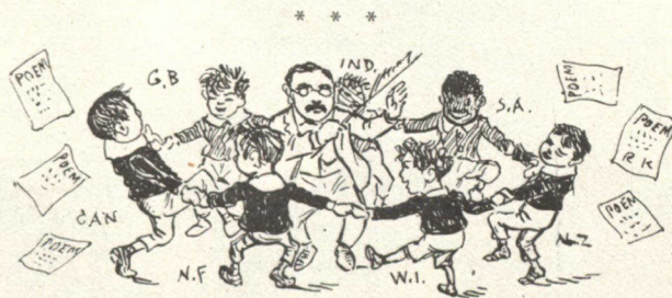
"Keeping the Boys Interested in each other."

the central portion of the province. It is an awkward choice.