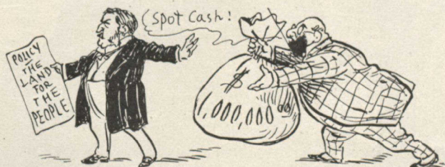
Whitney Nobly Said "No!"

It is said that the Premier of Ontario has refused a cash offer of one million dollars for one million acres of crown lands. Mr. Whitney will sell the public lands only to bona fide settlers. Mr. Whitney is a hard problem to solve. Some time ago, his government undertook to end a school-book monopoly and appointed a commission to investigate the case. After it reported, he turned round and made a fresh bargain with the monopolists and bought up their stock of condemned readers at bargain prices. Sometimes Mr. Whitney is against monopoly, sometimes he is in favour of it.