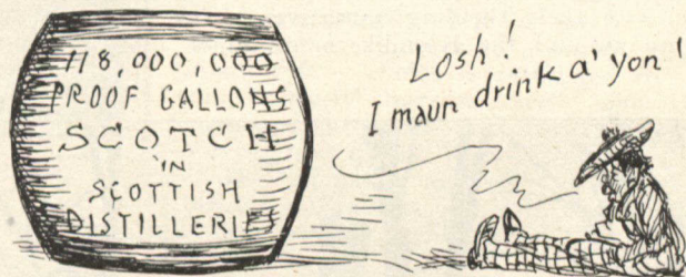
A Sense of Duty.

The President has managed to make so many remarkable utterances during his career that even his platitudes are regarded as impressive. When the Chief Executive is an authority on a vast variety of matters, varying from railway management to wild animals he has known, he is naturally considered an oracle.