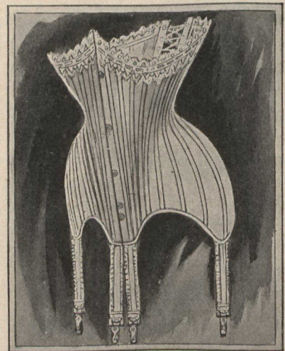
CR2-154. Corset , made of fine, light weight batiste, steel filled, girdle top, finished with lace and ribbon, long below waist and over hip, for slight and medium figures, white only, sizes 18 to 24. .95

Read our Liberal Guarantee and Free Delivery Offer in new Spring and Summer Catalogue.