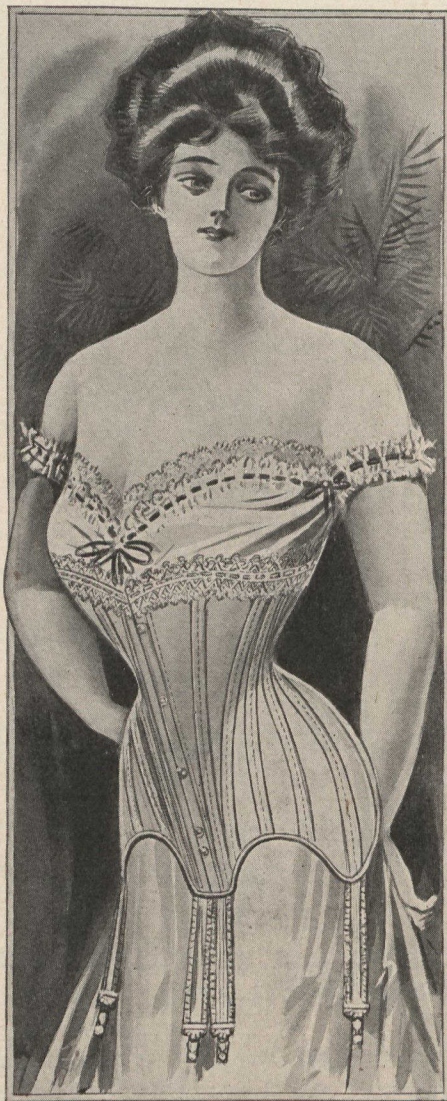
CR2-124. Corset , straight front, fine sateen, filled with steel wire, long hip, hose supporters attached, drab and white, sizes 18 to 26. .85 CR2-144. Same style as CR2-124, only fine batiste. .75

The new designs in Acme Corsets are now ready, and every pair is absolutely perfect fitting. The Moderate Prices are—35c, 50c, 75c, 95c.