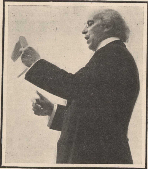
Quoting from the Enemy.