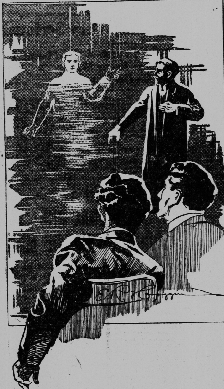
"Noislessly—Like a Puff of Gray-Blue Vapor—A Figure Emerged From the Air and Confronted Us."

looking pale and weak, but calm and mentally alert. He told me that he had held the "materialized form" as long as he could; but he felt "drawing out" of his vital force through his solar-plexus and from his forehead. "It is always hard to produce a form so far away," he said.