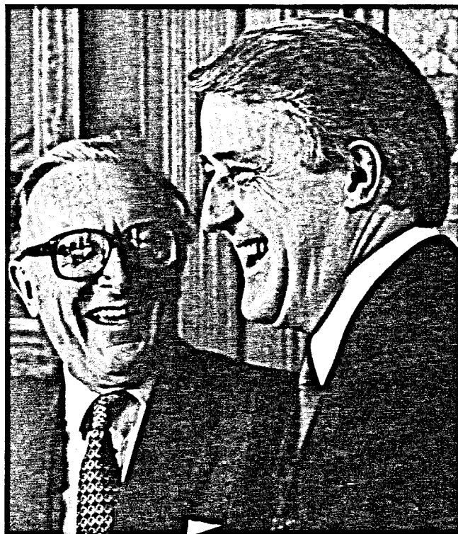
Prime Minister Mulroney has made clear Canada's intention to honour its commitment to the North Atlantic Treaty alliance. In early 1985, he met with newly-appointed NATO Secretary General Lord Carrington.

The top priority for the Mulroney Government is building a Canadian economy that is second to none in the world. To achieve this goal, the federal government is building a coalition of business, labour and other levels of government to work together on solutions leading to economic growth.