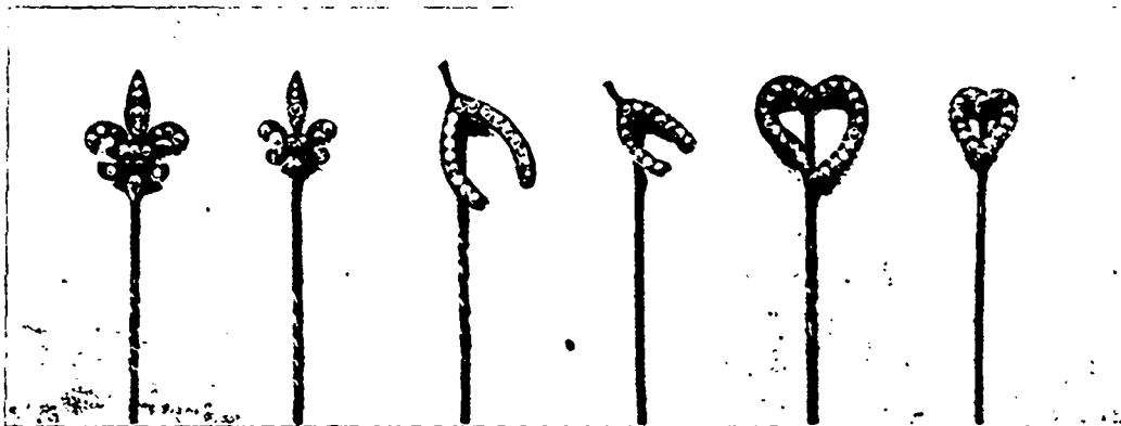
101 116 107 109 102 115 $4.00 each. $3.20 each. $4.00 each. $2.60 each. $4.00 each. $2.80 each.

Prices Subject to Catalogue and Cash Discounts.