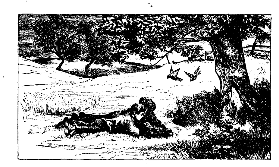
THE BOYS AND THE BIRD'S NEST.

The International Lesson Plan: The Lesson Committee. The Selection of Lessons.