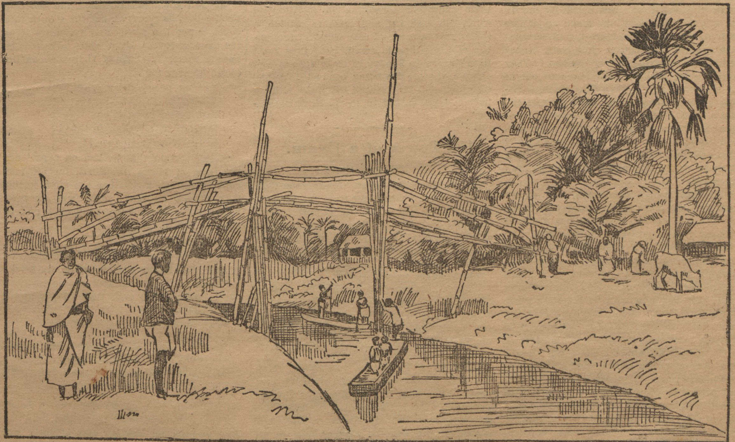
BAMBOO BRIDGE.