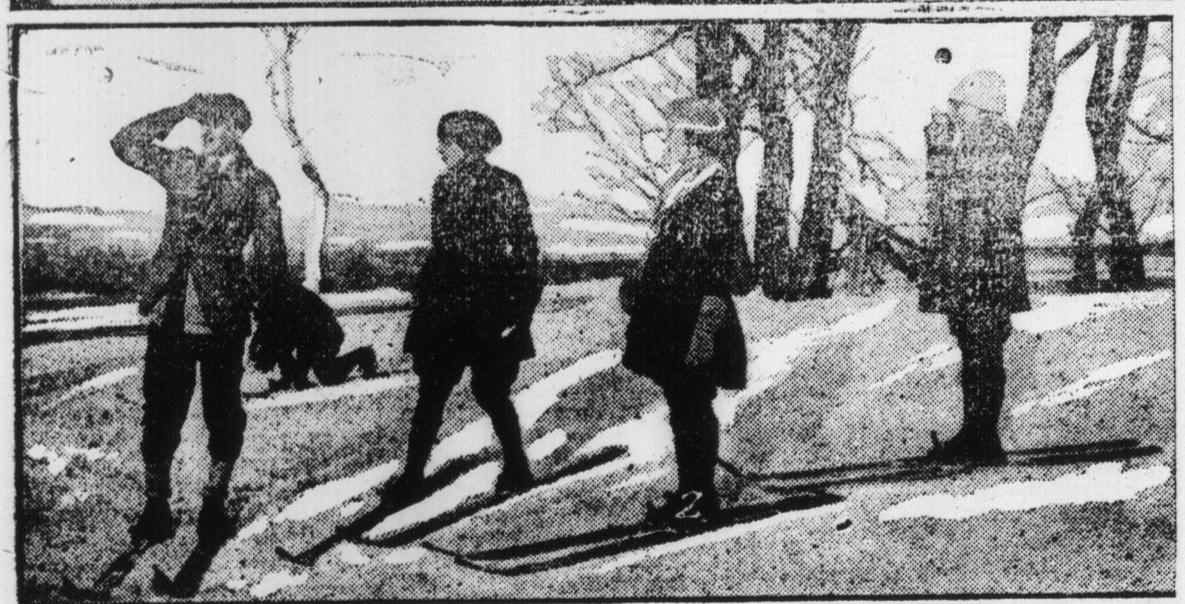
(1) Taking the Ski Jump opposite the Chateau Frontenac, Quebec, (2) Ready for a hike on skis at Quebec.