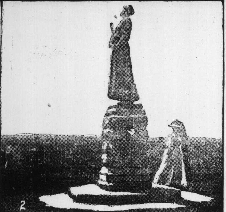
"Evangeline is the beautiful conception of an American poet whose verses we learnt to read on both sides of the Atlantic when we were children. History has shed another light on the Acadian story. We see today that British policy was not as black as it was painted. Whatever may be the truth of this story, as a woman, and an English woman, I shall always regard it as one of the most painful episodes in our annals. Thank God these cruel old days lie behind us forever, and from the fate of Evangeline has sprung a great wave of sympathy which has been carried on the healing hand of time. It is a good omen that the beautiful sun, God's healing hand, should be resting upon us all today, who are here to do honor to that sweet woman. Under these rays in your wonderful land so full of beauty and promise the old hatred is dead. I have now the great honor and privilege of unveiling the statue of