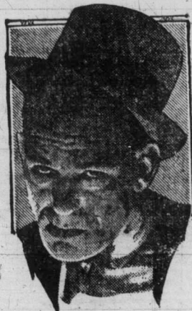
Lon Chaney supporting Priscilla Dean in "OUTSIDE THE LAW" A UNIVERSAL JEWEL PICTURE

Prices: Mat. (as usual). Eve., 20c, 25c. DON'T FORGET, 1ST EVE. SHOW AT 7