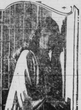
Priscilla Dean in "OUTSIDE THE LAW" A UNIVERSAL JEWEL PICTURE