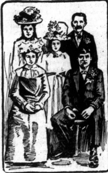
A POLISH WEDDING PARTY.

In some few instances the miner has left behind him in "the old country" a wife and children. As soon as he gets "on his feet" in this land of promise he sends for them, and a new home is added to the sum total in the mining town. In still other cases the miner's fannell shirt hides the burning heart of a lover, and the object of his regard has also been left behind to await the mending or making of his fortune. The case of the man with the sweetheart is also simple, for the way from Europe to America is open for a maid, provided she has the traveling expenses. These are sent to her by the miner, and then the priest is called upon. But it is with the great majority of the miners, who have neither wife nor sweet-