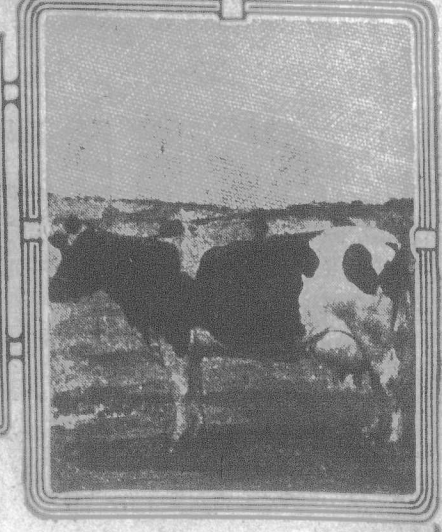
The products of first-class dairy cattle will always be in demand.

More choice cattle of recog-Productive Farms are Profitable Farms nized beef breeds are needed