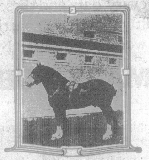
Prices of weighty drafters are read for an upward trend. Good

Prices for all classes of good live stock are likely to remain high in comparison with prices of grain and feed. Any shortage in grain may be made up much more quickly than the world depletion of good live stock can be repaired.