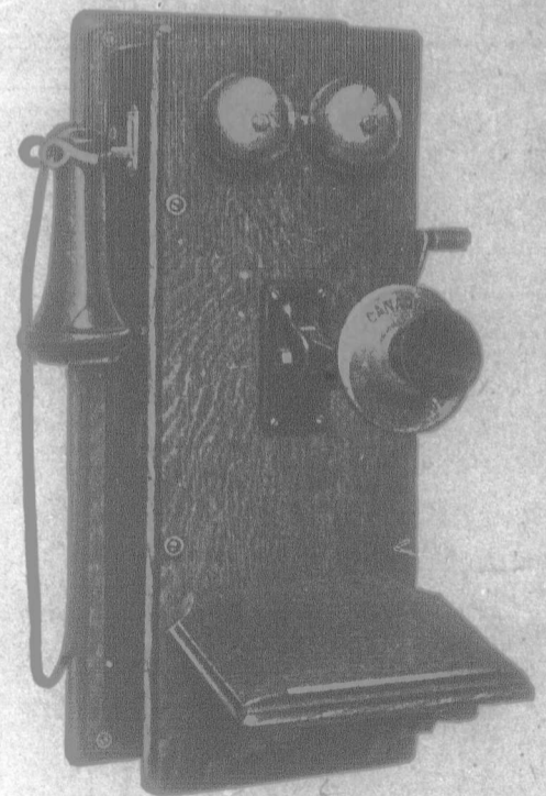
No. 6 Bulletin

If your system is in the market for new telephones, switchboards or materials, write for quotations. Prompt shipments of all lines are assured.