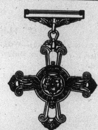
Distinguished Flying Cross

To all parts of the globe these men are going and will continue to go, manning planes of the United Nations. Across their bomb sights they will squint at industrial centres of the Nazis, tiled roofs of Japanese factories and ships of many sizes flaunting Axis flags. Through their gun sights, too, they will concentrate on aircraft bearing Fascist, Swastika and Rising Sun markings.