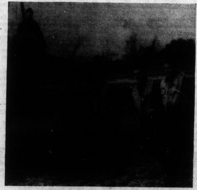
ON THE ALERT