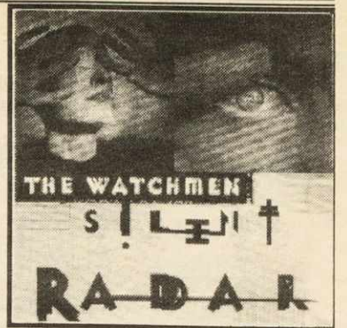
Silent Radar The Watchmen EMI

In the fall, the band plans to return to the US for another concert tour, and then return home in October to work on a new album, due out next summer.