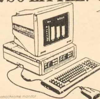
Single floppy / monochrome monitor

Introducing The Completely Amazing Amstrad PC 1512. Only $1,195.00