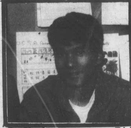
The Shadow BA I "The pain you feel after a good tackle."