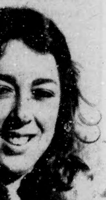
B.ED. 4 dy bear to bed!"

e and the dimensions n." his characters re of compassion is a comic writer intentions. He is, ord said of him in ht, "the most in- er of his genera-