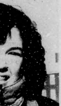
BPE - supply of Anti