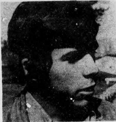
Al Hildebrand Science 2

"I would, because offices are expected to be modern, efficient and nice-looking. It was in bad shape and probably needed the renovation."