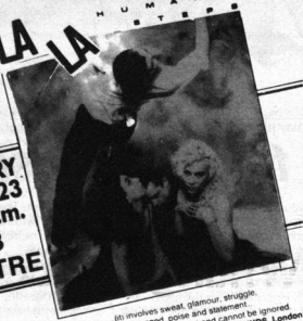
In movies sweat, glamour, struggle, humour, speed, passion and statement. HUMAN SEX must not and cannot be ignored. SOUNDS. London.

JANUARY 21, 22, 23 8:00 p.m. SUB THEATRE