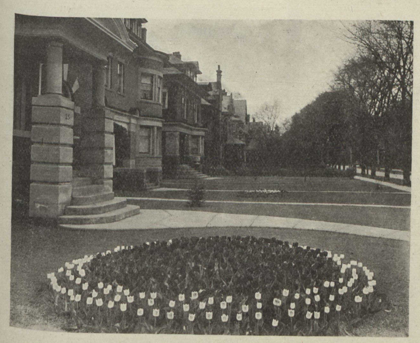
Tulips in two colours, as a boulevard decoration for early Spring. One of the English spots in Toronto.