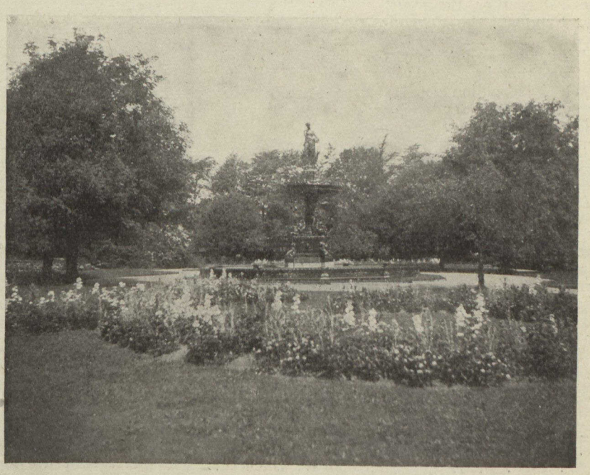
A beautiful combination of trees, lawn and flower plots. Art in the Public Gardens of Halifax.