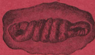
A Strand of Lead Wool coiled up for transit