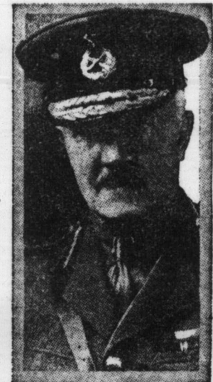
Urges Allies to Action.

A despatch from London says:—A Reuter despatch from Athens, dated Wednesday, says the French steamer Lamartine arrived there with 150 refugees from Smyrna, including a Greek journalist. The journalist asserted that Most Rev. Chrysostom, Metropolitan of the Greek Church in Smyrna, and the Armenian Metropolitan both were murdered, and that the Kemalists massacred about 2,000 Greek soldiers, whose bodies were thrown into the sea.