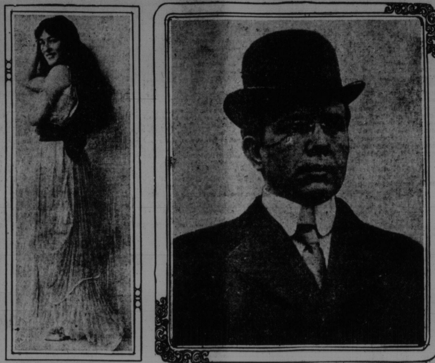
MRS. EVELYN NESBIT THAW AS SHE APPEARED YESTERDAY ON THE STAGE. HARRY K. THAW.