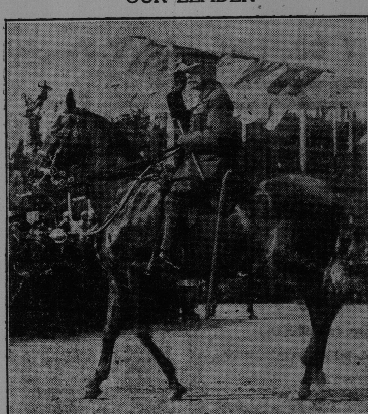
Field Marshal Earl Haig in the great Victory parade in Paris.