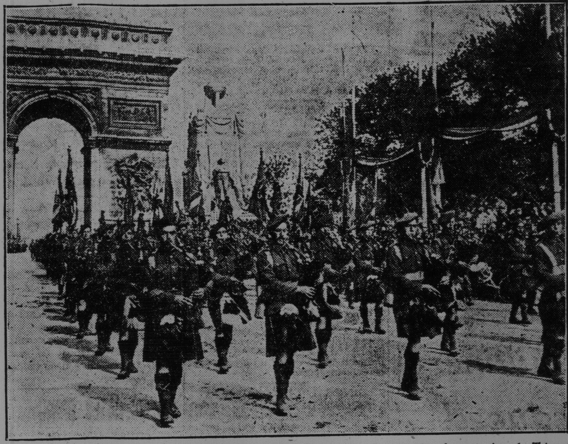
Scottish pipers in the great Victory parade in Paris just after passing through the famous Arc de Triomphe which had been closed since the war of 1870.

Wayagmack Bonds—500 at 86. W. L. due 1931—3000 at 99 1/2. Rubber Bonds—2000 at 96.