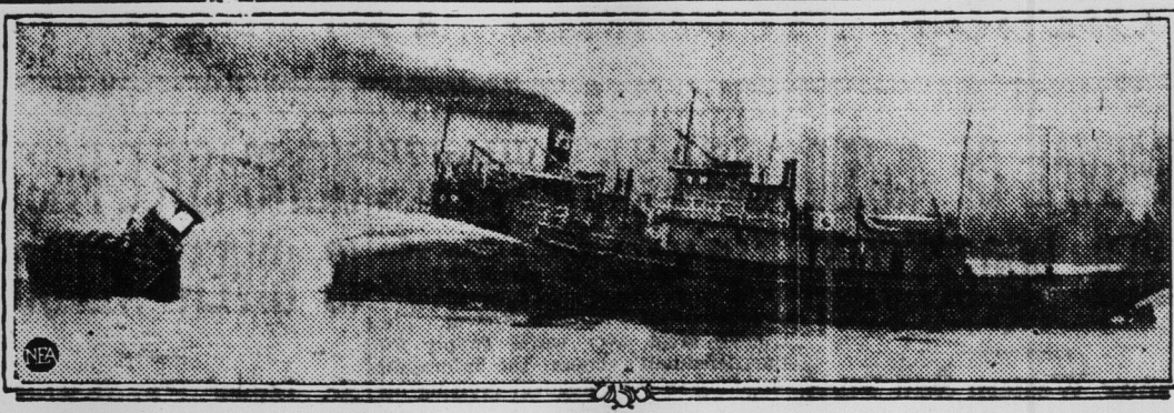
A tin lily could have done far on the petrol loss when fire destroyed the gasoline barge on the Schuyt. Kill River at Philadelphia. One member of the crew was severely, perhaps fatally, burned and a second could not be found after fireboats finally subdued the flames.

and special editors are being attempted. Cartoons are popular forms of expression, and in at least one instance a woman's page has been developed.