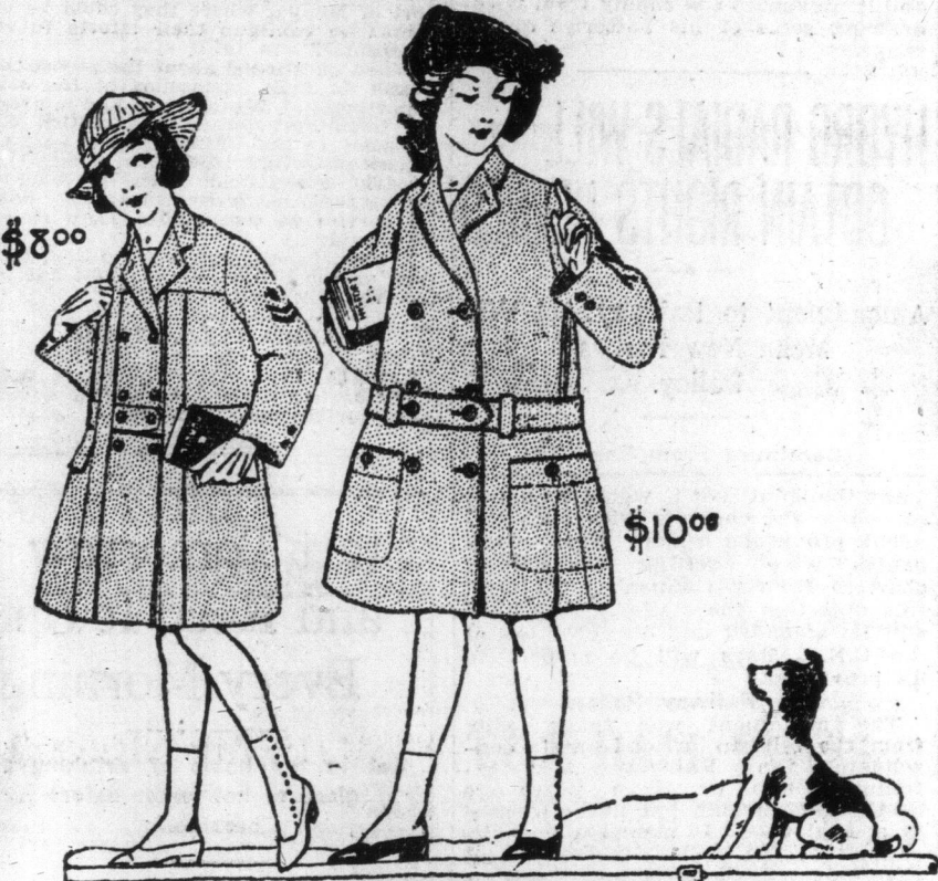
—Third Floor, Yonge St.

Both are obtainable in sizes 6 to 14 years.