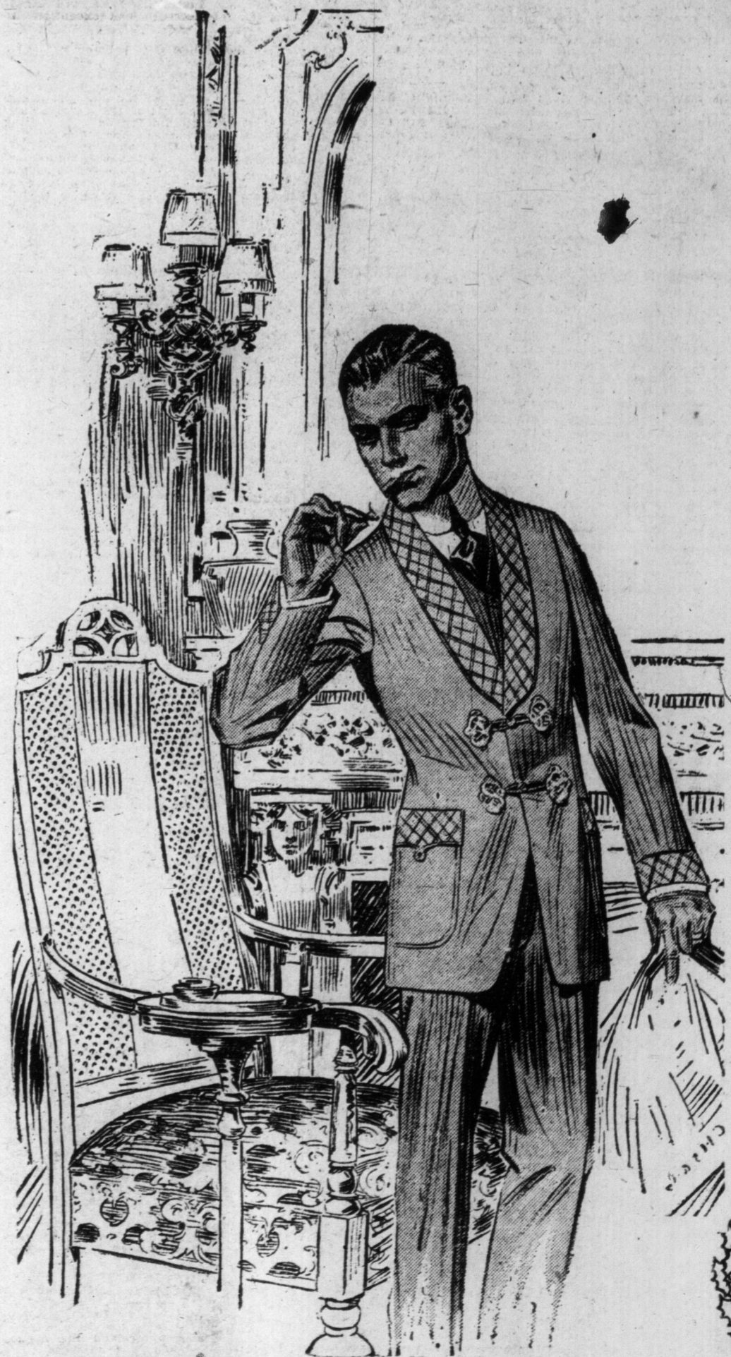
—Main Floor, Centre.

Men's Sweater Coats, fancy stitch and plain stitch, with shawl or “V” neck collar; some in fancy stripes, others plain shades of grey, brown, navy and maroon. Sizes 38 to 44. Price $7.00.