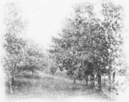
ON THE QUEEN'S ROYAL GROUNDS

the month of June a number of the Canadian volunteer battalions go into camp for two weeks, and during this time the old town is bright with