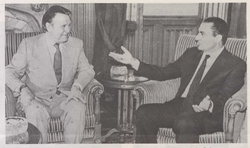
Mr. MacEachen (left) meets with Egyptian President Hosni Mubarak in Cairo.

Also at issue is the presence in Lebanon of the foreign forces of both Israel and Syria. In that connection, Canada's external affairs minister acknowledged that peace in the area depended on the withdrawal of Israeli forces from Lebanon.