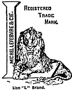
Lion "L" Brand.

... 20 First Prizes. Gold, Silver and Bronzo Medals.