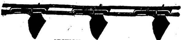
SECTION OF CONVEYOR.