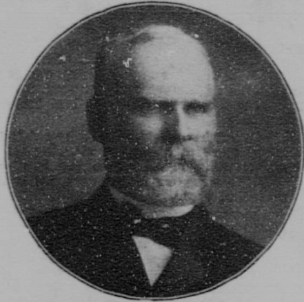
HON. E. J. DAVIS.