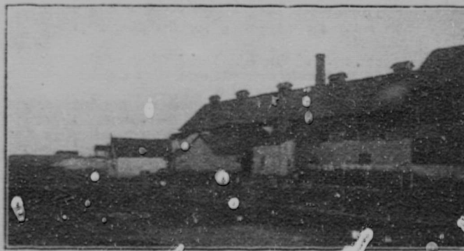
SITE OF A DITION TO THE KINGSTON TANNERY.