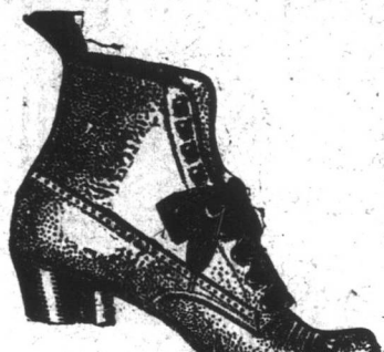
Genuine Tan Calf. Worth $10.00. Now $6.50.