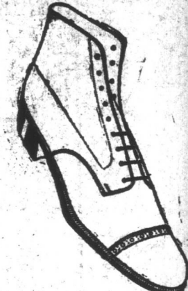
Pointed Toe; English Last. In Black and Tan Leather. $6.50.