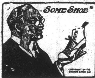
For $6.50. Black Leather; invisible eyelets.