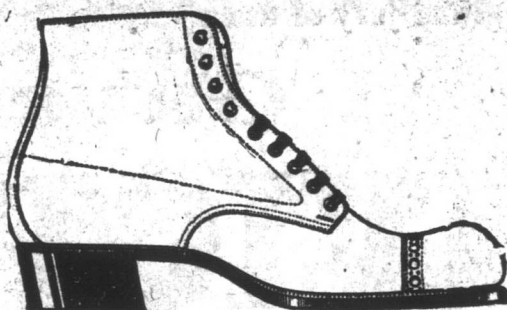
American Last. In Black and Tan Leathers. Worth $12.00 per pair for $6.50.