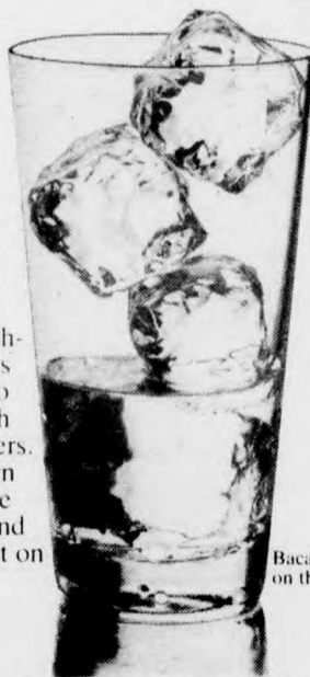
Bacardi rum on the rocks.

Sip it before you add your favourite mixer.