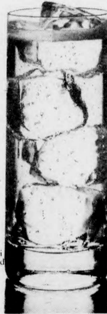
Bacardi rum and ginger ale.