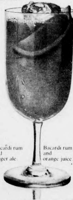
Bacardi rum and orange juice.