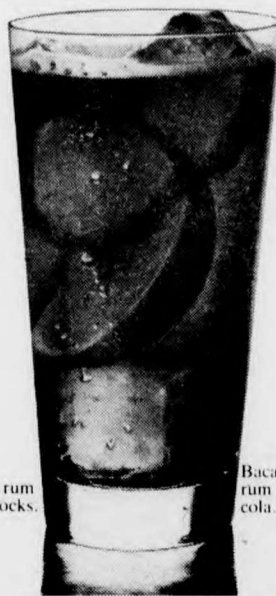
Bacardi rum and cola.